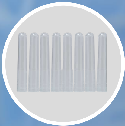
Strip of 8 tubes

8 X12 hole pattern on traditional 9mm centers